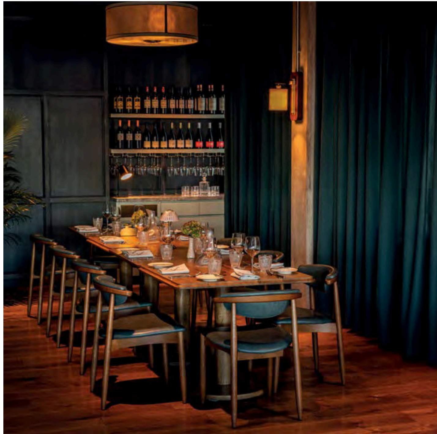
The private dining space within the main Cleaver & Wake restaurant