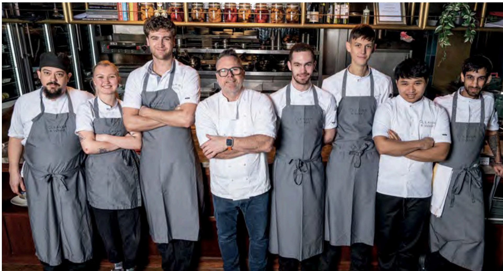
Menus curated and delivered by the Cleaver & Wake chef team